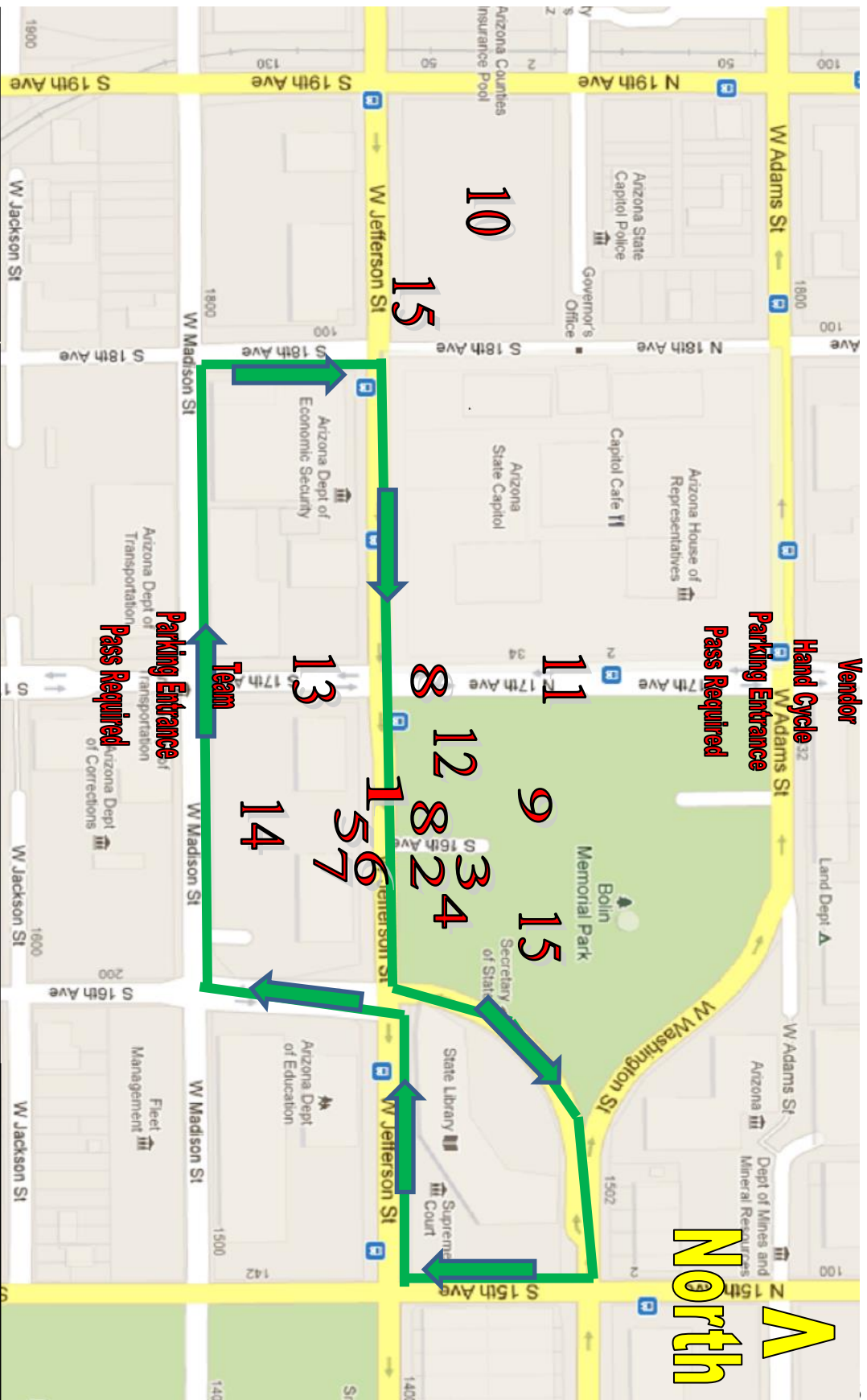
Jorden Hiser & Joy Criterium Map